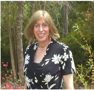
Executive Director, CPBIS