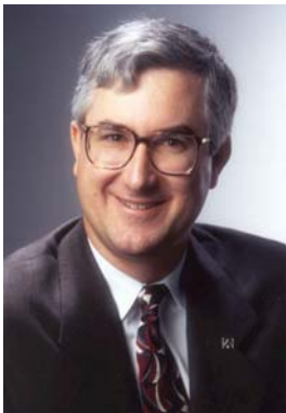
CPBIS Board of Executives Chair