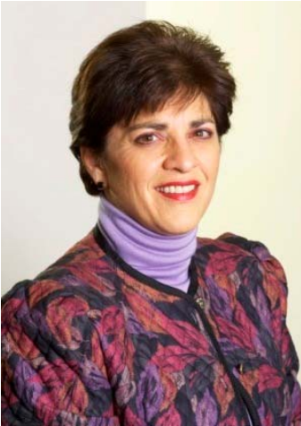
CPBIS Board of Executives Vice-Chair