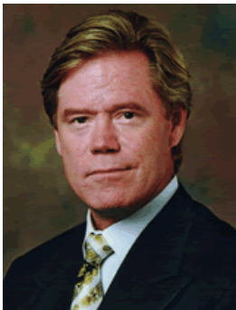
Director Enterprise 2020